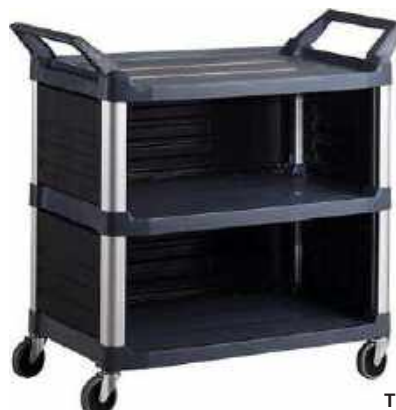
3 Deck TR 4023BK

Double Handles. Plastic Moulded Shelves. Non-Marking Swivel Castors. Aluminium Uprights. Non-Skid Textured Surface.