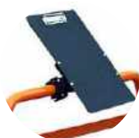
Trolley Clipboard Option RE T5 CLIPBOARD