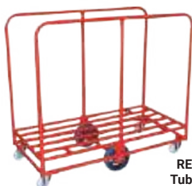
RE TMCLZ6R M24 Tube Deck (6 wheel)

High sides make this an ideal trolley for the movement of sheet materials, timber, pipe and similar loads. Also available with Poly or metal deck.