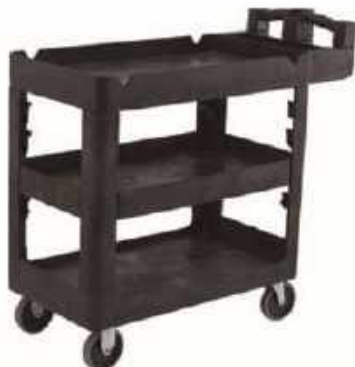
3 Shelf TR 4046BK

Innovative design for easily transporting any items. V-Notch for secure attachment of tubular items. User Friendly Handles. Sturdy Structural Foam Construction won't rust, dent, chip or peel.