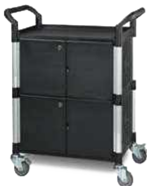
3 Deck TS HS828D

Sliding drawer stores small items and accessories while the back and side panels and lockable doors not only conceal contents but add extra security.