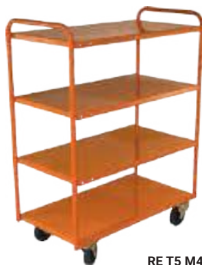
RE T5 M4GPFM64

The same as the Light Model 'G' with a reinforced base to accommodate a heavier wheel selection. Equipped with four (two fixed, 2 swivel) 150mm rubber wheeled castors.