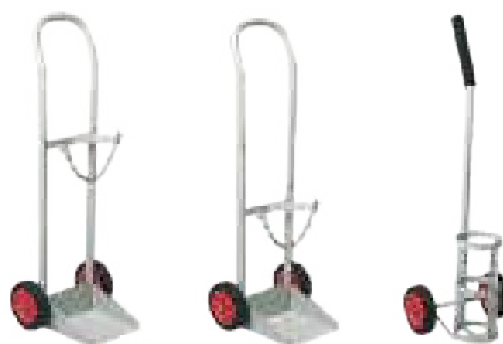
GL AX528 G and E size

Epoxy finished, compact handtrucks for oxygen cylinders. 150mm diameter rubber wheels. Ideal for hospitals or other healthcare facilities.