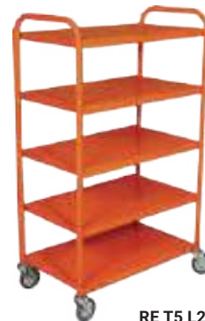
RE T5 L2HP L22