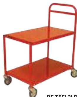
RE T5FL2LP L22

It features all-steel construction with orange or beige powdercoat finish with a load capacity of up to 200kg in total. Equipped with four (all swivel) 125mm diameter Thermoplastic Elastomer (TPE) castors.