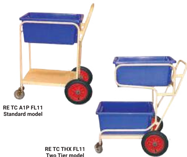
RE TC A1P FL11 Standard model

The large diameter pneumatic wheels and push handle make the Binmate Buggy a suitable alternative for many outdoor applications. The range has been designed to suit Nally #7, #10 or #15 plastic bins which are purchased separately.