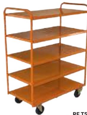
RE T5 M4HPFM64

The same as the Light Model 'H' with a reinforced base to accommodate a heavier wheel selection. Equipped with four (two fixed, 2 swivel) 150mm rubber wheeled castors.