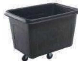
TR 4710BK / TR 4711BK