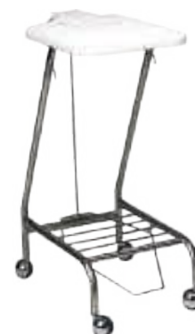
AC 758201 Single Linen Skip with Lid