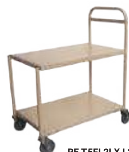
RE T5FL2LX L22