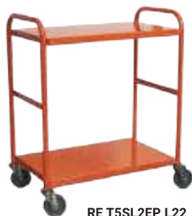
RE T5SL2EP L22

Equipped with four (all swivel) 125mm diameter Thermoplastic Elastomer (TPE) castors.