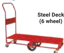
Steel Deck (6 wheel)