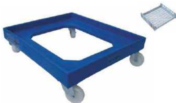
Suits NA IH323 Bread Crate

Australian Made. Standard colour Blue. Food Grade Plastic. Other colours available POA.