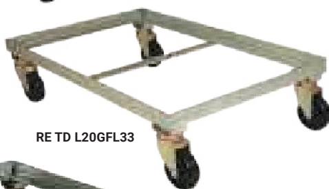
RE TD L20GFL33