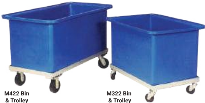
M422 Bin & Trolley