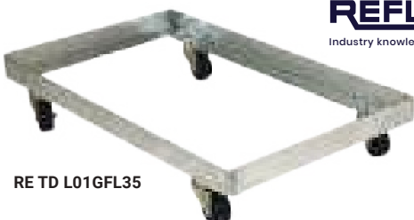
RE TD L01GFL35

REFLEX EQUIP since 1972 Industry knowledge ... with advice you can trust