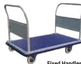
Fixed Handles TSXL12