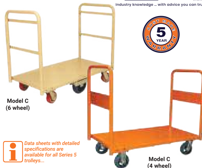
Model C (6 wheel)