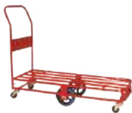
Tube Deck (6 wheel)