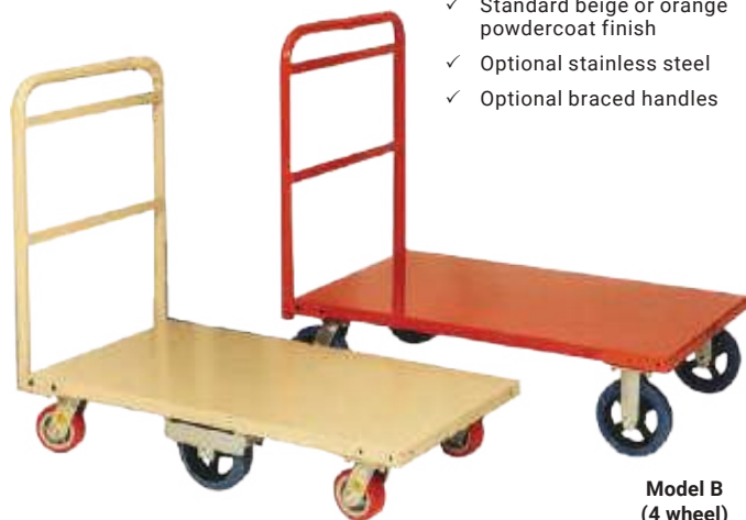
Model B (6 wheel)