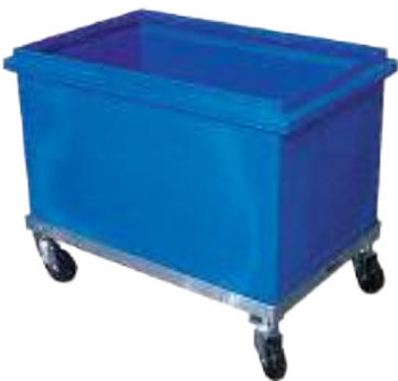
M180 Bin Trolley