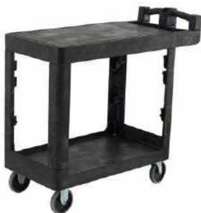
2 Deck TR 4045BK

Innovative design for easily transporting any items. User Friendly Handles. Sturdy Structural Foam Construction won't rust, dent, chip or peel.