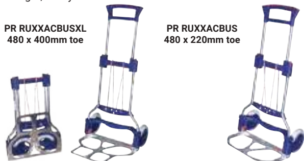
PR RUXXACBUSXL 480 x 400mm toe

With an easy to use elastic tie down system the Ruxxac Cart is ideal for sales representatives, repair personnel and couriers looking for a lightweight, easily stowed hand truck. Available in two toe sizes.