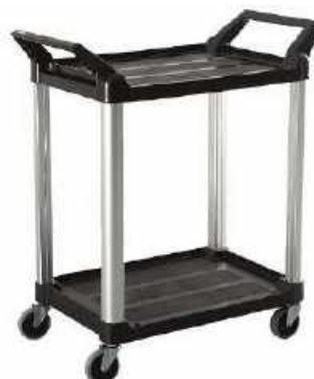
2 Deck TR 4020BK

Double Handles. Plastic Moulded Shelves. Non-Marking Swivel Castors. Aluminium Uprights. Non-Skid Textured Surface.