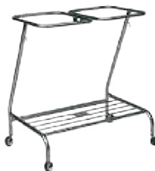
AC 758051 Double Linen Skip

This double stainless steel linen skip is ideal for healthcare environments and is available with or without a foot operated acrylic lid.