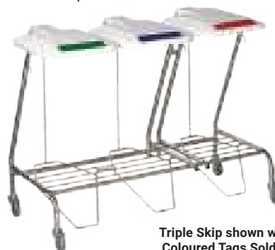
Triple Skip shown with Optional Coloured Tags Sold Separately

This triple stainless steel linen skip is ideal for healthcare environments and is supplied with foot operated white acrylic lids. Optional Coloured ID strips are available.