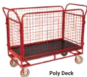
Poly Deck (4 wheel)

Available with tube, Poly or steel 1300 x 600mm deck size with a load capacity of 450kg. Also available with an all-round optional buffer.