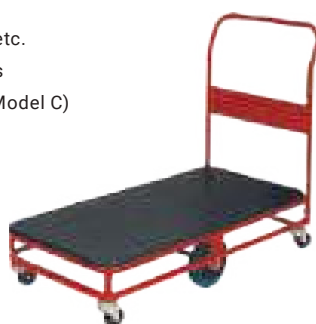
Poly Deck (6 wheel)