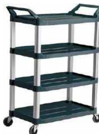
4 Deck TR 4026BK

Double Handles. Plastic Moulded Shelves. Non-Marking Swivel Castors. Aluminium Uprights. Non-Skid Textured Surface.