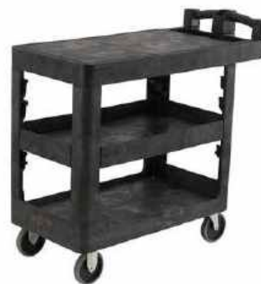
3 Deck TR 4047BK

Innovative design for easily transporting any items. User Friendly Handles. Sturdy Structural Foam Construction won't rust, dent, chip or peel.