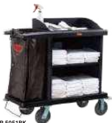
TR 5031BK/TR 5051BK

A complete system solution for housekeeping in the hospitality industry featuring commercial grade moulded construction with 200mm non-marking wheels and locking brakes.