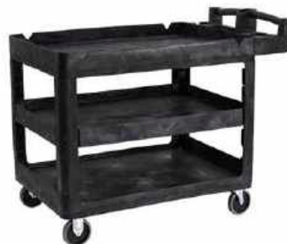
3 Deck TR 4043BK

Innovative design for easily transporting any items. V-Notch for secure attachment of tubular items. User Friendly Handles. Sturdy Structural Foam Construction won't rust, dent, chip or peel.