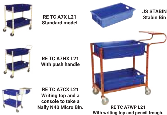
RE TC A7X L21 Standard model

Similar to the BinMate Two Tier trolley; fits two bins, one top and one bottom, ideal for sorting situations. Standard finish is powder coated; optional finishes are stainless steel.