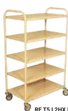
RE T5 L2HX L22

Equipped with four (all swivel) 125mm diameter Thermoplastic Elastomer (TPE) castors.