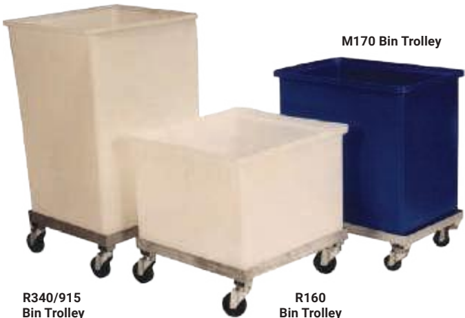
R340/915 Bin Trolley