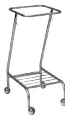
AC 758001 Single Linen Skip

This stainless steel linen skip is ideal for healthcare environments and is available with or without a foot operated acrylic lid.