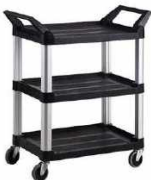
3 Deck TR 4011BK

Double Handles. Plastic Moulded Shelves. Non-Marking Swivel Castors. Aluminium Uprights. Non-Skid Textured Surface.