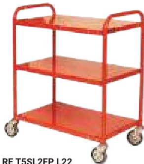
RE T5SL2FP L22