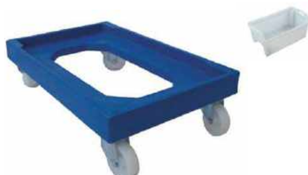
Suits NA IH066 Fish Crate

Australian Made. Standard colour Blue. Food Grade Plastic. Other colours available POA.