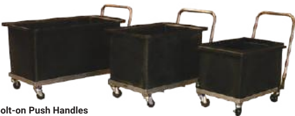
Bolt-on Push Handles