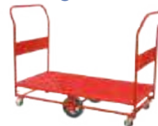
Steel Deck (6 wheel)