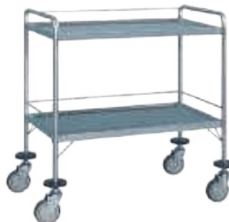
VO V322 SS

Welded stainless steel construction with two recessed shelves with rounded internal corners for easy cleaning. Guard rails on three sides of all shelves, with 460mm clearance between shelves on two deck and 280mm on three deck. Revolving buffers fitted to each leg with 125mm diameter chrome plated, ball bearing castors.