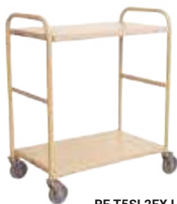
RE T5SL2EX L22