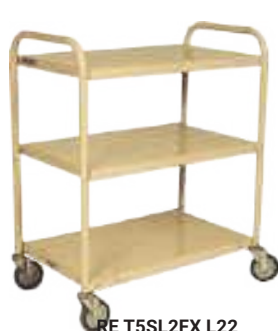
RE T5SL2FX L22

Equipped with four (all swivel) 125mm diameter Thermoplastic Elastomer (TPE) castors.