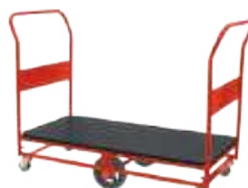
Poly Deck (6 wheel)