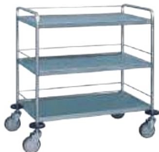
VO V323 SS

Welded stainless steel construction with three recessed shelves with rounded internal corners for easy cleaning. Guard rails on three sides of all shelves, with 460mm clearance between shelves on two deck and 280mm on three deck. Revolving buffers fitted to each leg with 125mm diameter chrome plated, ball bearing castors.