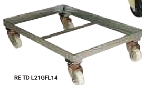
RE TD L21GFL14