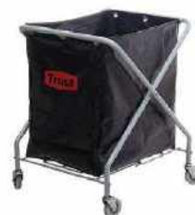
TR 5041/TR 5042