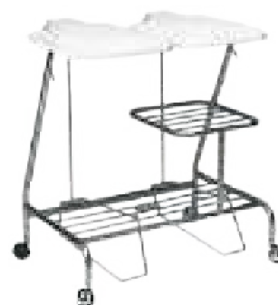
AC 758251 Double Linen Skip with Lid