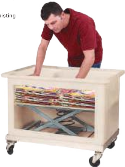
Cut-a-way view of BINSERT mechanism

Bolt-on Push Handles are an optional addition to your Reflex Big Bin Trolley.