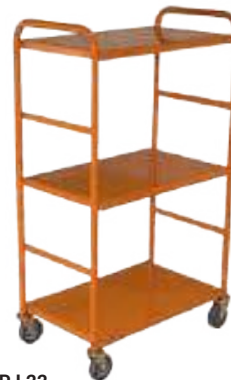
RE T5 L2MP L22