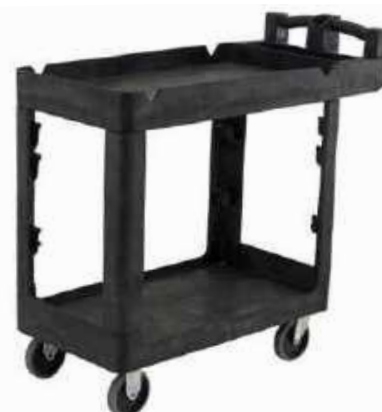
2 Shelf TR 4044BK

Innovative design for easily transporting any items. V-Notch for secure attachment of tubular items. User Friendly Handles. Sturdy Structural Foam Construction won't rust, dent, chip or peel.