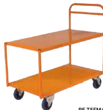
RE T5FM4LP M64

Equipped with four (2 fixed, 2 swivel) 150mm rubber wheeled castors.