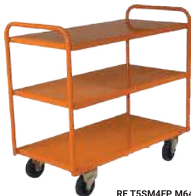
RE T5SM4FP M64

The same as the Light Model 'F' with a reinforced base to accommodate a heavier wheel selection. Equipped with four (two fixed, 2 swivel) 150mm rubber wheeled castors.