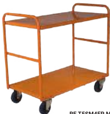
RE T5SM4EP M64

Equipped with four (2 fixed, 2 swivel) 150mm rubber wheeled castors.