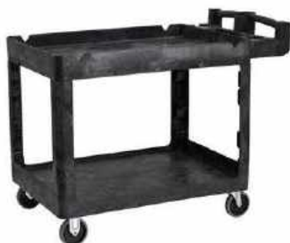
2 Shelf TR 4041BK

Innovative design for easily transporting any items. V-Notch for secure attachment of tubular items. User Friendly Handles. Sturdy Structural Foam Construction won't rust, dent, chip or peel.