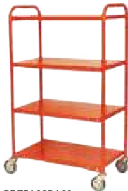
RE T5 L2GP L22