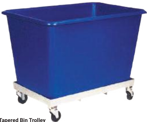
M500 Tapered Bin Trolley