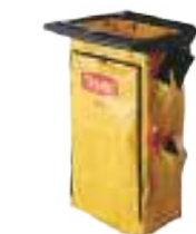
Optional TR 6978YE Polyliner with Side Bag to suit TR 5011BK also available