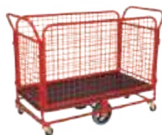
Poly Deck (6 wheel)