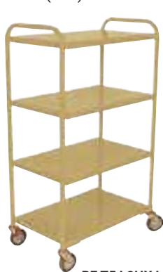
RE T5 L2HX L22

Equipped with four (all swivel) 125mm diameter Thermoplastic Elastomer (TPE) castors.