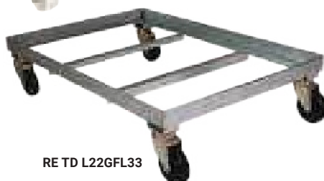
RE TD L22GFL33