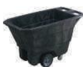
TR 4612BK Laundry & Waste Tilt Cart

For Waste Collection, Material Handling & Laundry Handling. Fits through Standard Doorways and into elevators easily Metal Frame & Industrial Strength Structural Foam Construction.