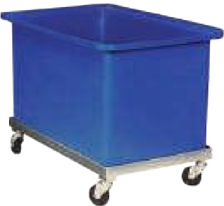
M322 Bin Trolley