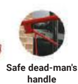
Safe dead-man's handle