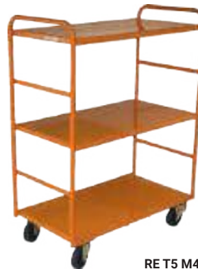
RE T5 M4MPFM64

The same as the Light Model 'M' with a reinforced base to accommodate a heavier wheel selection. Equipped with four (two fixed, 2 swivel) 150mm rubber wheeled castors.