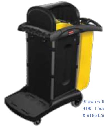
High Capacity Cleaning Cart 1264 x 559 x 975 RM 9T7200BLA with options 9T85 & 9T86

Shown with optional 9T85 Locking Door Kit & 9T86 Locking Hood