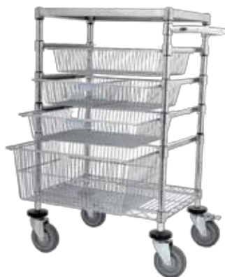
Sliding Basket Trolley 610 x 460 x 1020mmH RN TB91464L22