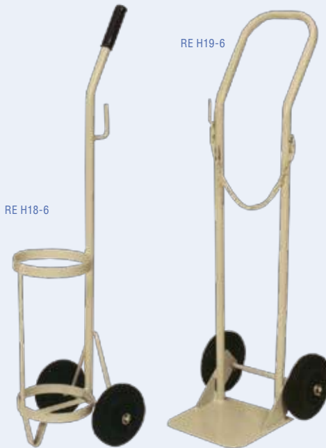
OXYGEN BOTTLE HANDTRUCK Suits 'D' size cylinder RE H18-6 Suits 'E' size cylinder RE H19-6