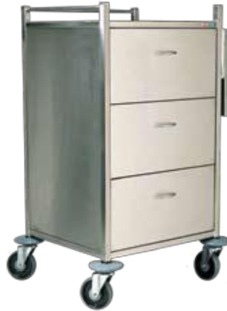
Medication Trolley 600 x 490 x 1100mm MED 0676