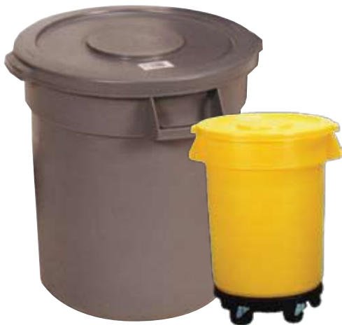
Brute Round Bins, Lids and Dollies 38, 76, 121, 166 and 208 litre Lids & Dollies to suit