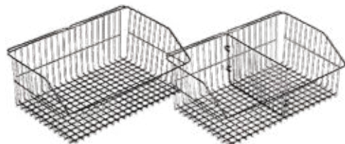
Wire Basket with Divider Wire Basket with divider WB240 with D240 divider XXXXXXXXXXXX