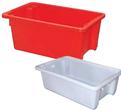
STACKANESTA FOOD GRADE BIN 645 X 413 X 210MM NA IH060 | 645 X 413 X 276MMr NA IH051