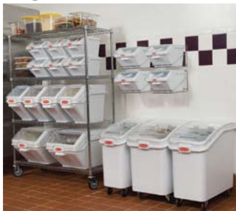
ProSave Ingredient Bins Rectangular design and one handed access plus integrated measuring tool promotes food safety compliance.