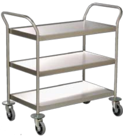
Clearing Trolley - 3 Shelf 900 x 490 x 900mm CLEA 0150