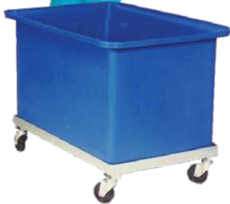
M322 BIG BIN WITH DOLLY 320 litre - 1005 x 710 x 780mm external RE TD LBM322L33