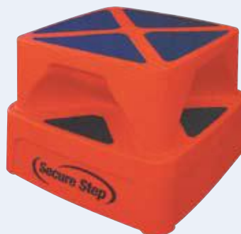
STEP STOOL 480 x 480 x 360mm LI IN3020