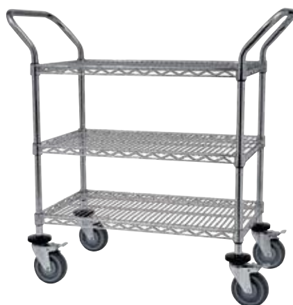
Multi Deck TrolleyTrolley 460 x 760 x 1020 RN UT3A