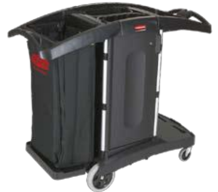
Housekeeping Cart 1314 x 558 x 1118 RM 9T7600BLA