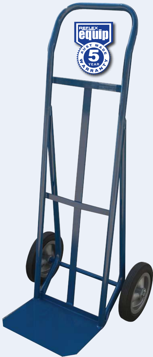
STRAIGHT BACK HANDTRUCK Toe: 355 x 230mm Height: 1230mm RE H12M-1