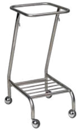
Single Linen Skip - no lid 380 x 540 x 850mm SLIM 02861