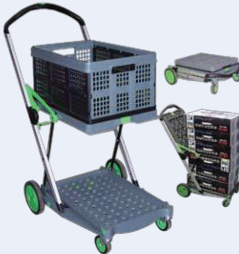
Clax Folding Cart 670 x 470 x 110mm Cart/Crate PR CLAXMOBIL Spare Crate PR CLCRATE