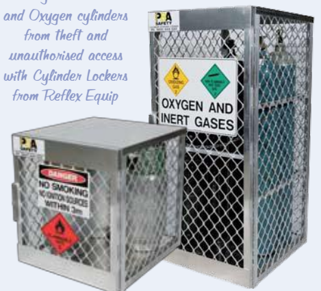
GAS CYLINDER LOCKER 4 Cylinder vertical locker PC 23009 5-10 Cylinder vertical locker PC 23006

Safely secure LPG and Oxygen cylinders from theft and unauthorised access with Cylinder Lockers from Reflex Equip