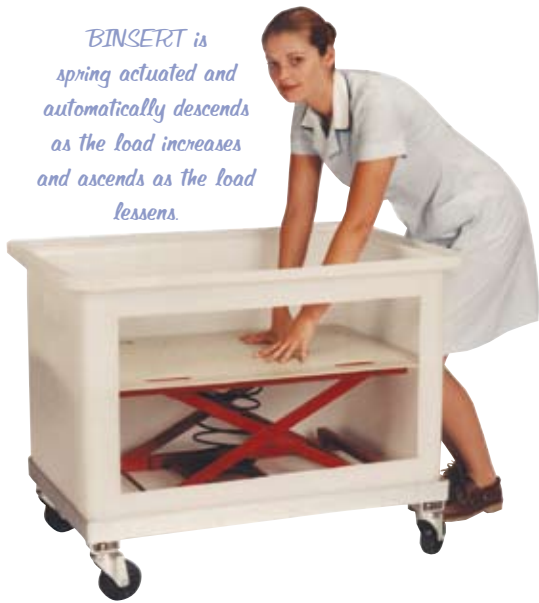
BINSERT Suits M322 Bin - 40kg Spring RE BSM32240

BINSERT is spring actuated and automatically descends as the load increases and ascends as the load lessens.