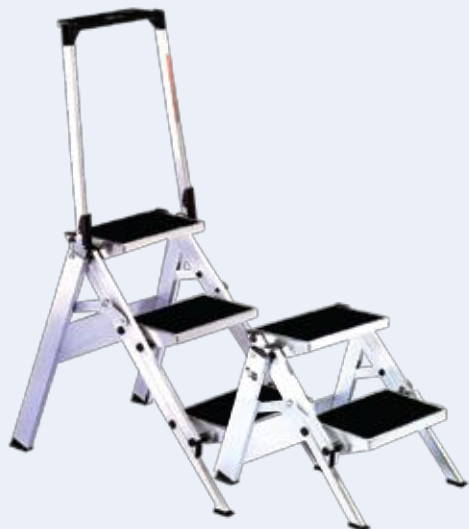
LITTLE JUMBO LADDER 2 Step LJ 210C 3 Step with Handrail LJ 310B