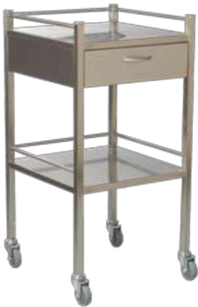
Instrument Trolley 490 x 490 x 900mm GL INST0054