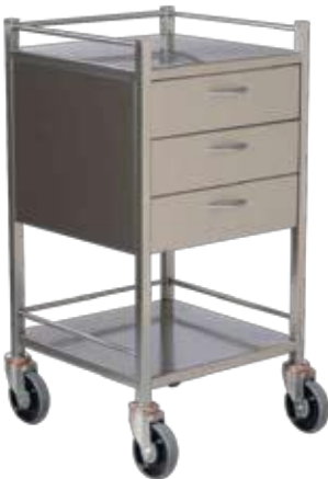
Instrument Trolley 490 x 490 x 900mm INST 0076