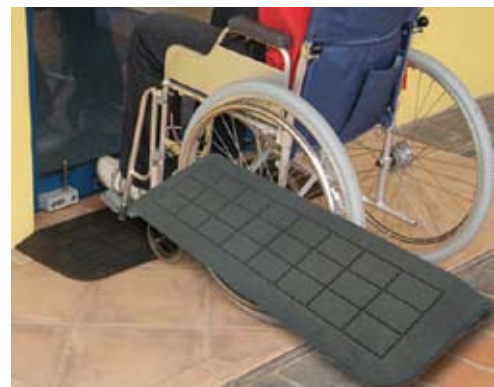
Access Ramps 900 x 200 x 25mm CM AR0 1270 x 457 x 44mm CM AR2 1067 x 305 x 32mm CM AR1 1524 x 610 x 55mm CM AR3