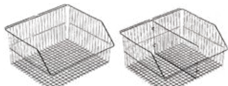
Wire Basket with Divider Wire Basket with divider WB120 with D120 divider XXXXXXXXXXXX