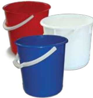
INDUSTIAL QUALITY BUCKETS 13.6 litre NA N151RE | 18.2 litre NA N258WH | 22.7 litre NA N075BLU

BINSERT is spring actuated and automatically descends as the load increases and ascends as the load lessens.