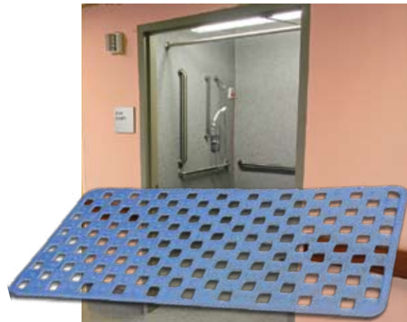
Bath & Shower Mat Bath 760 x 340mm Shower 560 x 560mm Bath: CM BM4070 Shower: CM SM5050