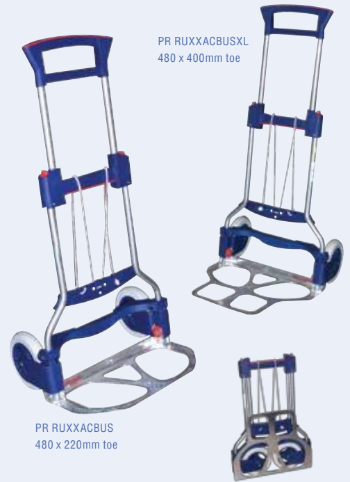
PR RUXXACBUSXL 480 x 400mm toe