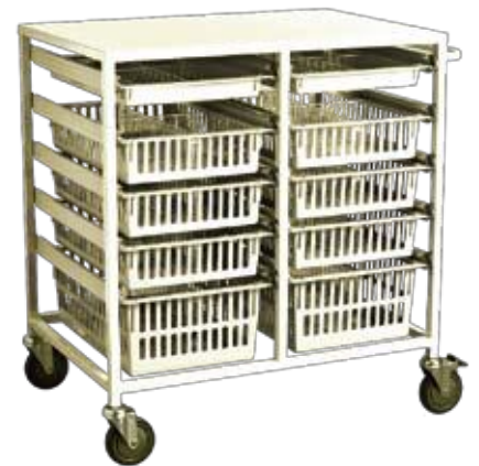
Medstor 10 tray 900 x 650 x 1000mm GL M2000