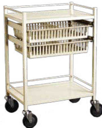
Medstor 2 tray 660 x 460 x 945mm GL M1600