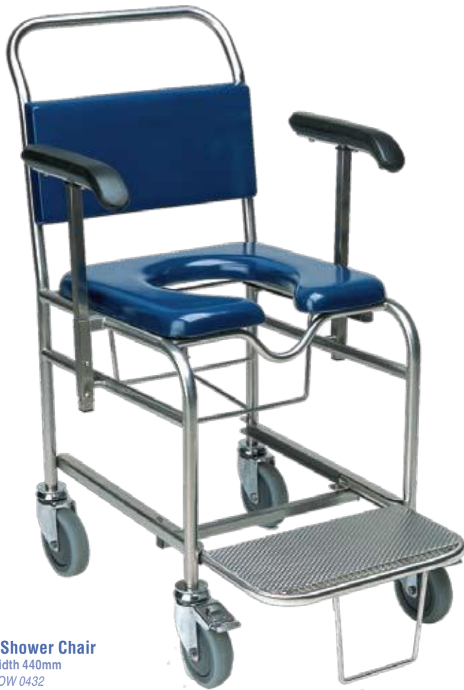
Stainless Shower Chair Seat width 440mm SHOW 0432