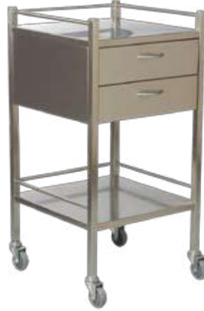
Instrument Trolley 490 x 490 x 900mm INST 0066