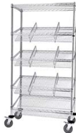
Suture Trolley 910 x 460 x 1760mmH RN ST91465L22

In-Line High Density Compact Storage System. Makes efficient use of your storeroom, only one access aisle required over a 5 metre area. Mobile units are fitted with waist high handles and 125mm castors to ensure safe and easy movement in such a way as to comply with OH&S requirements. Extensive range of accessories such as ledges (preventing items falling off the shelves) dividers, baskets and label holders.