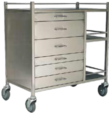
Anaesthetic Trolley 600 x 490 x 900mm ANA 0105