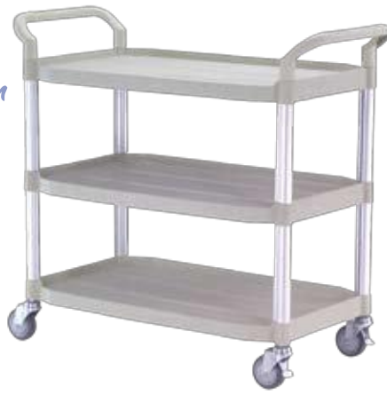
Large Service Cart - Grey 1100 x 520 x 1020mm RN GRA-808-LA3