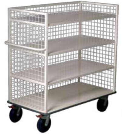
Imprest Trolley 1270 x 630 x 1330mm IMPR 0190