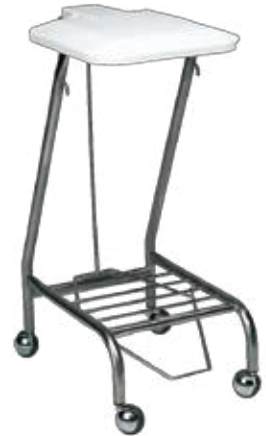
Single Linen Skip - foot operated lid 380 x 540 x 850 SLIM 0291