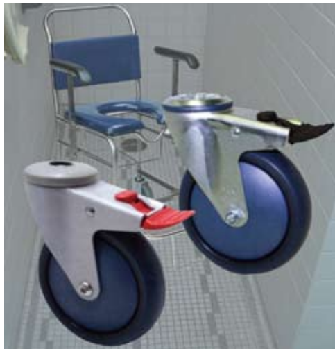
125mm Shower Chair Castors Powder Coated FA MJA125GMPH22 :: FA MJA125GMPHB22 Braked Stainless Steel FA MJA125GMSH :: FA MJA125GMSHB Braked

For larger trolleys and beds it is hard to go past our Big M range that features excellent design and performance. With a 5 year warranty on the fork and a 3 year warranty on the wheel the Big M range is a viable option for many applications.