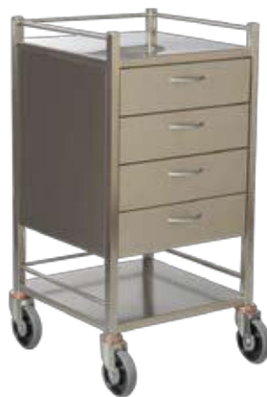
Instrument Trolley 490 x 490 x 900mm INST 0080