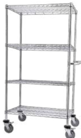
4 Deck Trolley 460 x 1220 RN CW12204604