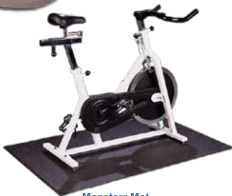
Monsterr Mat 1200 x 900mm & 1960 x 900mm CM MM34 & CM MM36