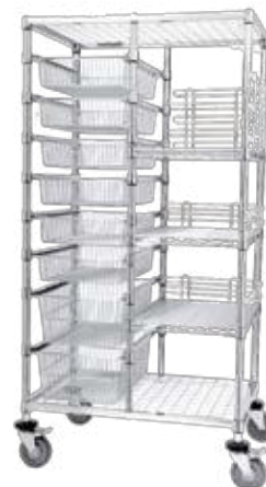
Combination Trolley XXXXXXXXXXXX XXXXXXXXXXXX