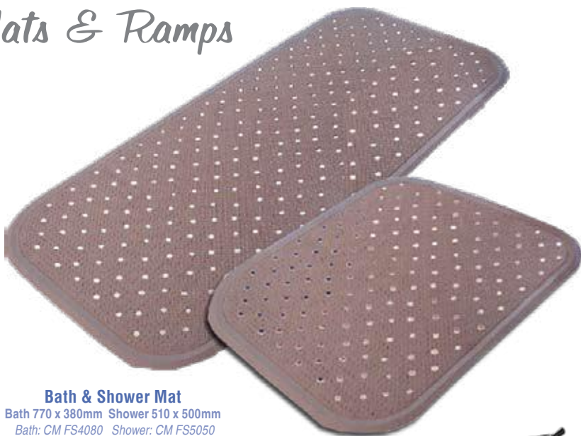
Bath & Shower Mat Bath 770 x 380mm Shower 510 x 500mm Bath: CM FS4080 Shower: CM FS5050