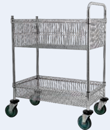
Mail Trolley 760 x 460mm RN MT183014025

Safely secure LPG and Oxygen cylinders from theft and unauthorised access with Cylinder Lockers from Reflex Equip