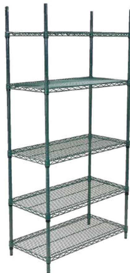
Cool Seal Shelving Epoxy Coated Wire Shelving is specifically designed for Wet Storage areas (although it is also used in Dry Store Areas) and in particular Cool Rooms / Freezers in Hospital Kitchens, Hotels and Restaurants. Cool Seal shelving is available in 33 shelf sizes and 4 post heights and needs no tools for assembly. Shelf spacing is easily adjustable every 25mm.