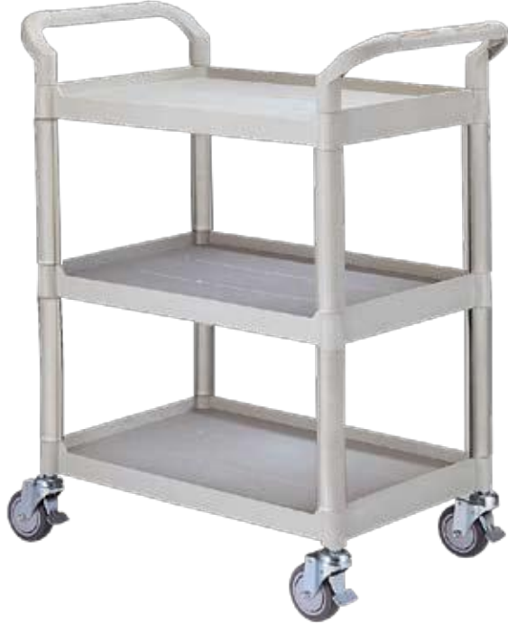
Small Service Cart - Grey 850 x 480 x 1020mm RN GRA-808-A3

Durable and attractive carts to perform a wide variety of tasks in the Healthcare industry