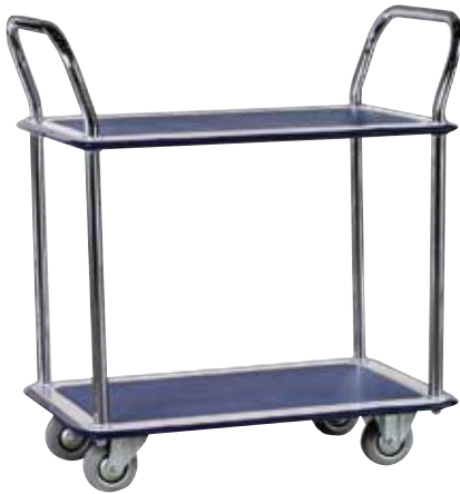
2 Deck Vinyl Top Trolley 740 x 480 x 1000mm RN HL120