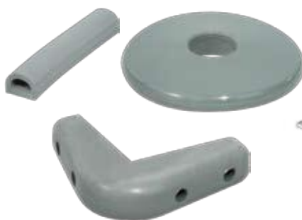
Replacement Trolley & Castor Buffers available