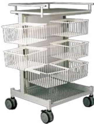
Theatre Supply Storage Cart 6 Swing out baskets - 2 fixed THEA 0636