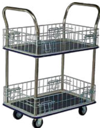
2 Deck Vinyl Top Trolley - Mesh Surround 40 x 480 1000mm RN HL120M

Shown with optional 9T85 Locking Door Kit & 9T86 Locking Hood