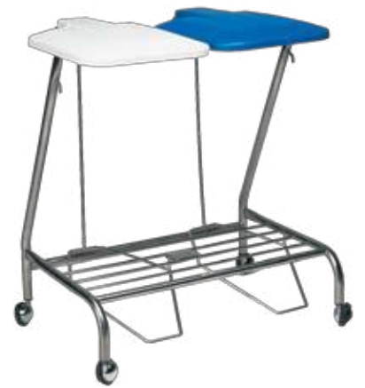
Double Linen Skip - foot operated lid 780 x 540 x 850 SLIM 0300