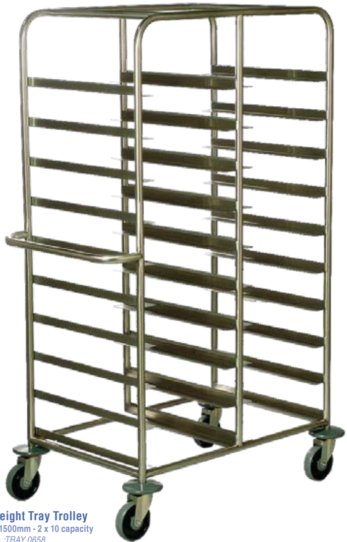
Light Weight Tray Trolley 680 x 550 x 1500mm - 2 x 10 capacity :TRAY 0658