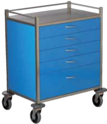
Emergency Equipment Trolley 750 x 490 x 900mm EMER 0117