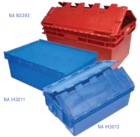
NA NS393 NA IH3011 NA IH3013 SECURITY CRATE 625 x 405 x 310mm NA NS393 | 510 x 345 x 295mm NA IH3011 | 510 x 345 x 185mm NA IH3013