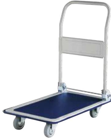
Folding Handle Platform Trolley 740 x 480 x 1000mm RN HL110