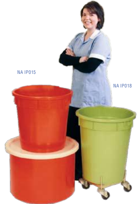
NA IP015 NA IP018 NA IP025 shown with optional lid Optional Dolly NA TD L03ZFL35