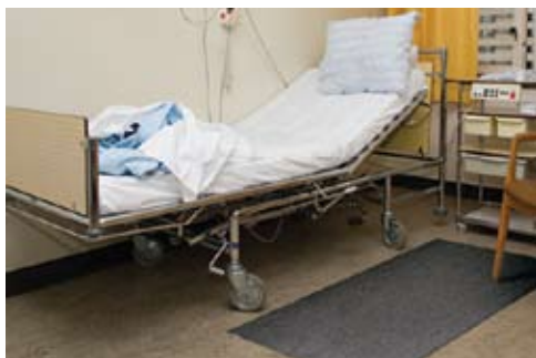
Wondersorb Mats 900 x 600mm CM WS23CHL 1200 x 900mm CM WS34CHL 1500 x 900mm CM WS35CHL