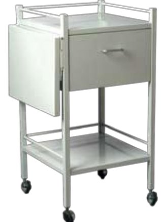
Medication Trolley 600 x 490 x 1100mm MED 0677