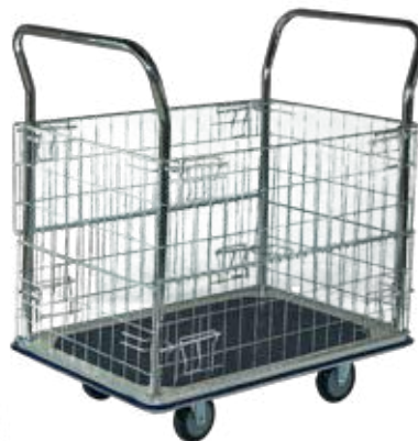
2 Deck Vinyl Top Trolley - Mesh Surround 40 x 480 1000mm RN HL113