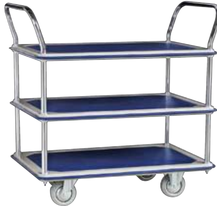
3 Deck Vinyl Top Trolley 740 x 480 x 1000mm RN HL130