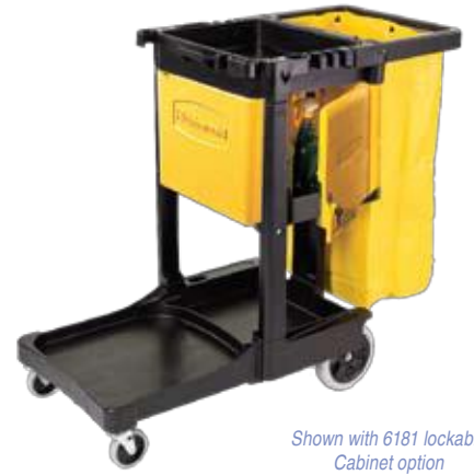
Janitor Cart / Cleaning Trolley 1168 x 552 x 975 RM A617388BLA