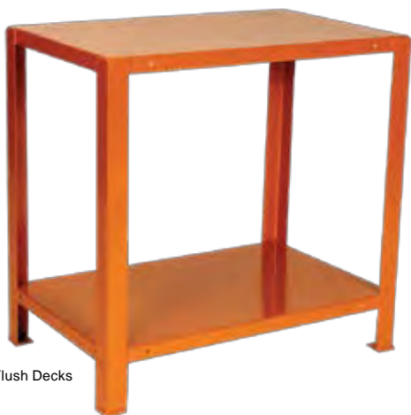
Static Model, Flush Decks

Ideal for general workshop and factory use.