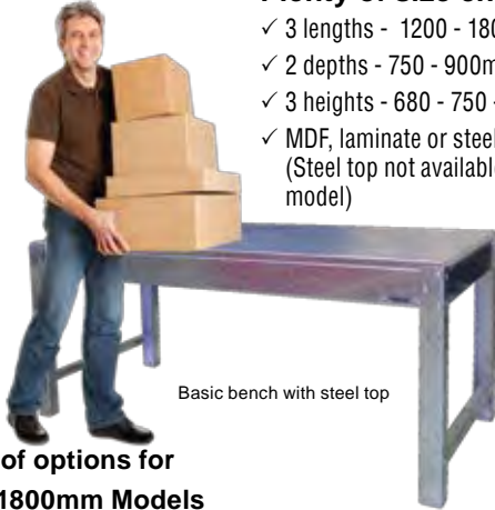
Basic bench with steel top