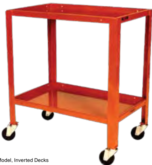
Mobile Model, Inverted Decks