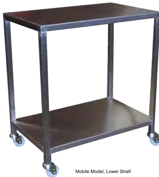
Mobile Model, Lower Shelf