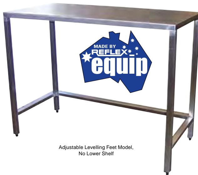
Adjustable Levelling Feet Model, No Lower Shelf